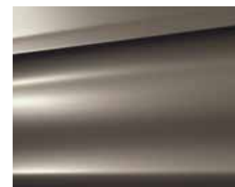
Mativoire Beige (metallic)