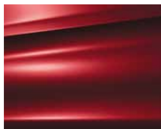
Exuberant Red (metallic)