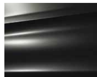
Graphito Grey (metallic)