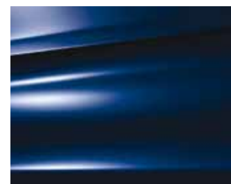
Nocturne Blue (metallic)