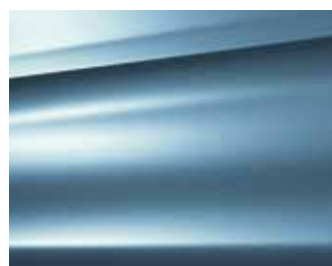
Tuscan Blue (pearlescent)