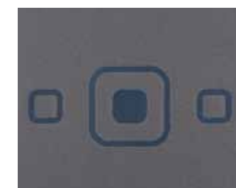
Blue 'Irisban' cloth