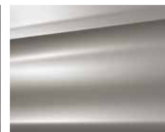
Garbato Grey (metallic)